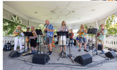
The Moonrise Cartel The Cukes The Moonrise Cartel – at night

MAKE MUSIC DAY was brought to you by Town of Fairfield, Connecticut Department of Economic and Community Development – Office of the Arts (with funding from the National Endowment for the Arts), and many other sponsors and volunteers.