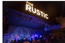
MOAS rocking a packed house