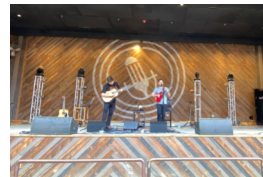
Acoustic Set Soundcheck

Monkeys On A String is a Dave Matthews Tribute Band based out of San Antonio, TX. Purple Cow was brought in to help them sound and feel like the real DMB.